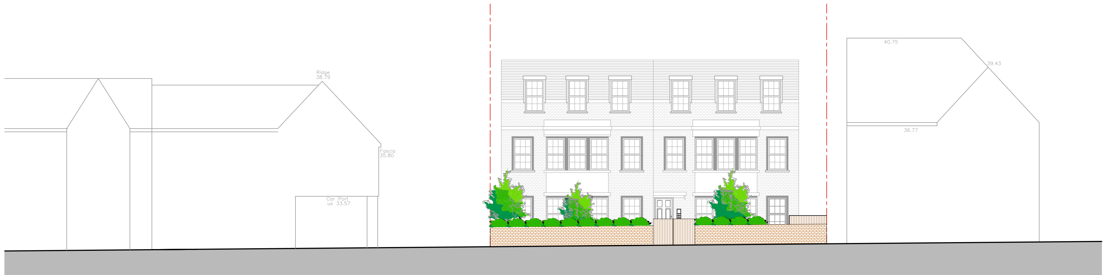
Proposed Street Elevation Scale 1:100