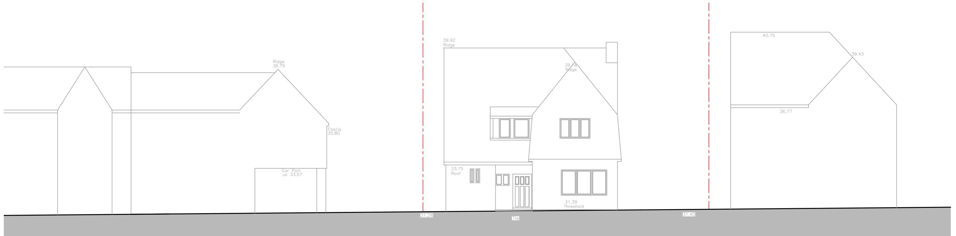
Existing Street Elevation Scale 1:100